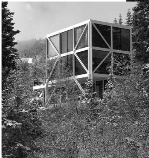
The Mooney/Sparano house (above) as seen in Emigration Canyon.